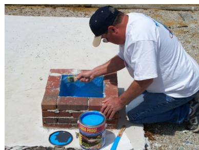
Brush or roll 2 coats of waterproofing membrane onto area to be waterproofed.