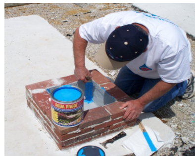
Brush waterproofing membrane into all corners.